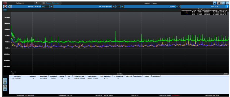
Quickly Scan 3-States of Power Line Conductors (CTL-SW Sensor Sweep w/PLA II)